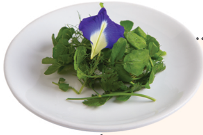
MESCLUN IN SIMPLE VINAIGRETTE