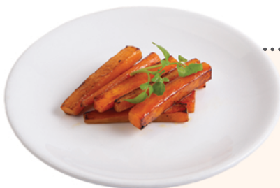
WINE HONEY GLAZED CARROT