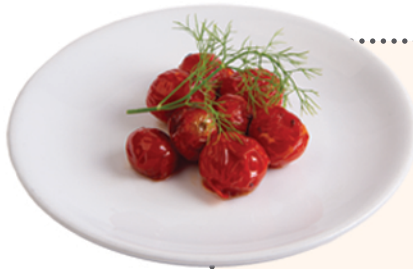
CHERRY TOMATO CONFIT