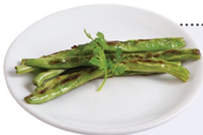
LEMON CHAR GRILLED GREEN BEANS