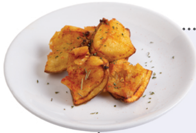
SMASHED HERBS POTATOES